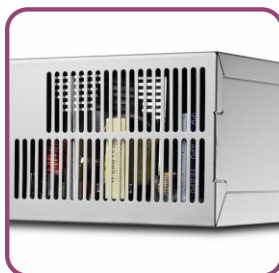
Ventilation channels enhance cooling efficiency