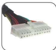
20+4pin Motherboard Connector x1