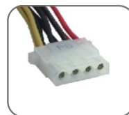
4pin Peripheral Connector x 5