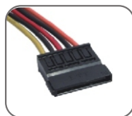
S-ATA Connector x 3