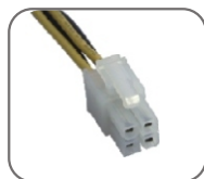
4 pin +12V CPU Connector x 1