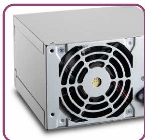
Low noise 80mm fan