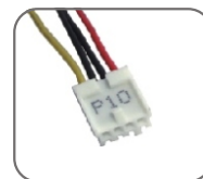
4 pin Floppy Connector x 1